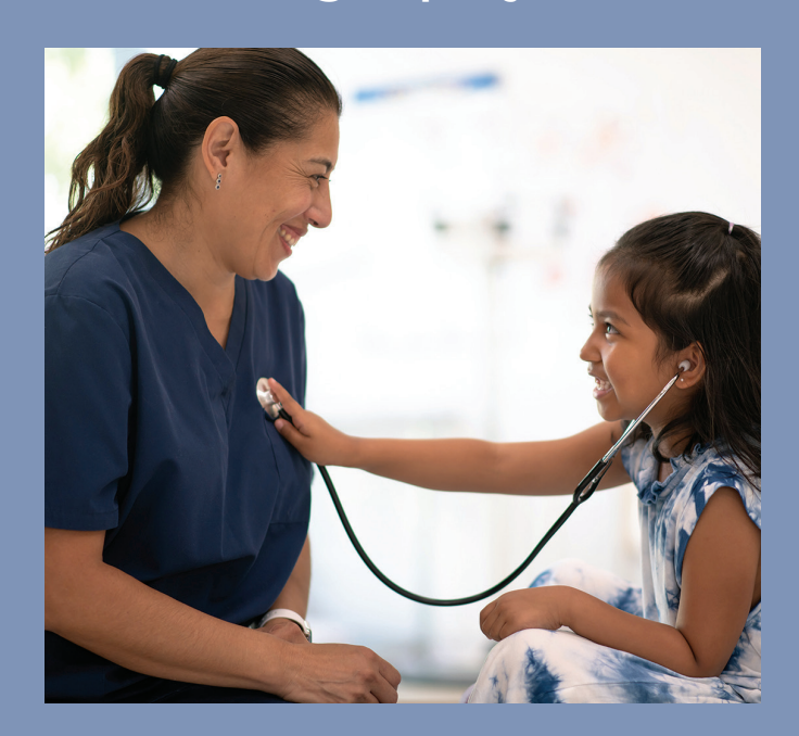
Since 2004, the Foundation has awarded more than 500 special grants to departments across ZSFG.

These one-off grants were developed to meet the specific, unique, or time-sensitive needs of ZSFG providers. By responding directly to evolving needs, we can positively impact the hospital's ability to best serve its patients and ensure that health equity and patient care remain at the center of its work.