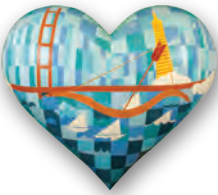
JUDITH LIPPE CITY BY THE BAY