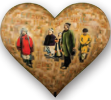
TRINH MAI LOOKING INTO THE FUTURE AND REMEMBERING THE PAST