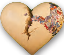
WENDY GOLD HEARTS AFLUTTER