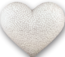
NATALIE GUY KIMETA HEART