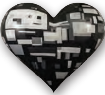
SHILO RATNER THE SPACES IN BETWEEN