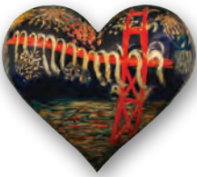
SAUL LEVY DIAMOND JUBILEE HEART