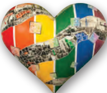
PERE GILFRE BEAT TO BIT