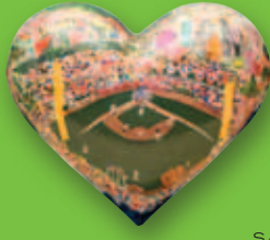
SAUL LEVY "THE HEART SURGEON"