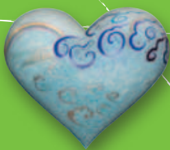
KEIKO NELSON "HEART & HEART, SAN FRANCISCO"