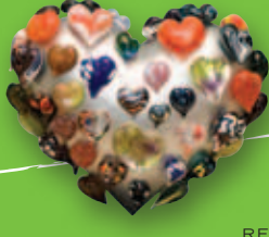
REED SLATER "SMALL JOYS"