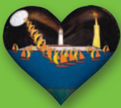
JOHN KRAFT "NIGHT & DAY"