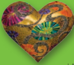
LAUREL TRUE "PARADISE"