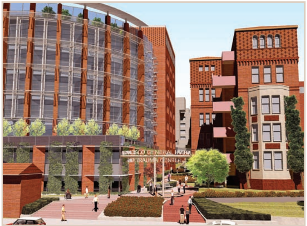
Hospital renderings courtesy of Fong & Chan Architects

To begin with, the emergency department, which O'Connell terms "very, very overcrowded," will more than double in capacity from the current 28 beds to 60. The number of medical, surgical, and critical care beds will increase, as well.