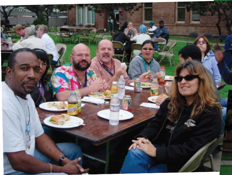
Enjoying friends and co-workers at the Luncheon.