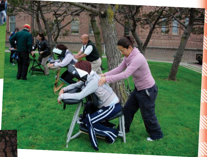
Hospital employees enjoying the free massages provided by Traveling Massage.