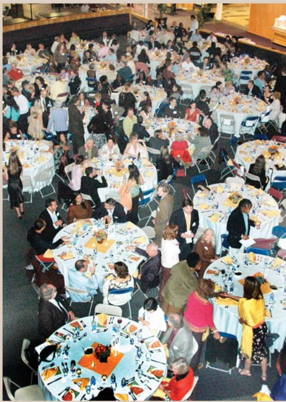
Trauma Recovery Center: Healing Mind & Spirit dinner.