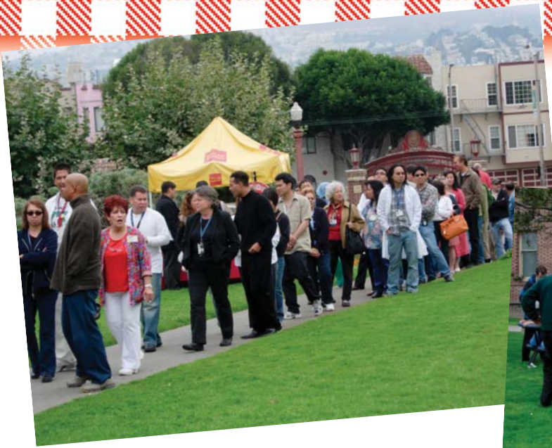
A lack of sun didn't deter attendance!